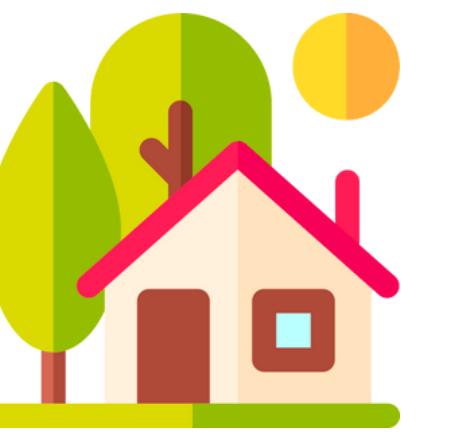
In the community

For more information, scan the QR code with your phone: